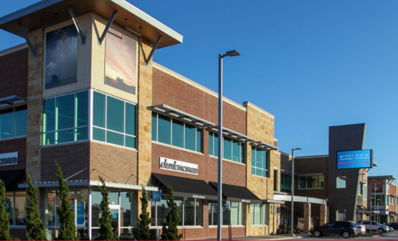
2 ND FLOOR SPACE FOR LEASE